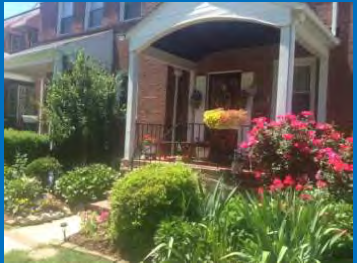
3000 block Tioga Parkway

The Parkway Community Association celebrates the lives of two of its members who were an inspiration to the neighborhood. - Carey